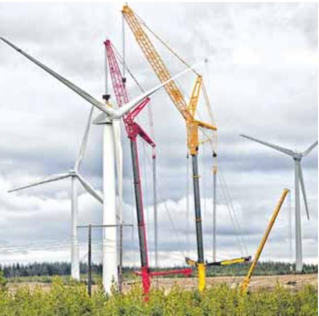
A set of propellers about to be lifted with cranes from a wind farm near Kilmihil.