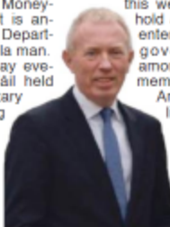
● Clr Timmy Dooley (FF)

Fellow Clare TDs Cathal Crowe (FF) and Joe Cooney (FG) have not been in the reckoning thus far for a Junior Ministry.